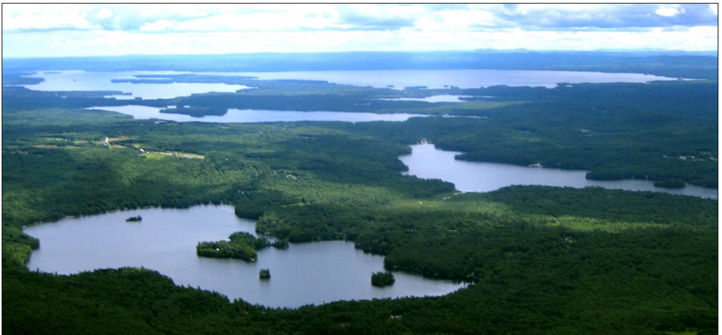
Raymond Pond (lower left), Crescent Lake (middle right), Panther Pond (middle-left), Thomas Pond (middle top- barely visible), and Sebago lake (top).

Our mailing address: PO Box 1243, Raymond, ME 04071